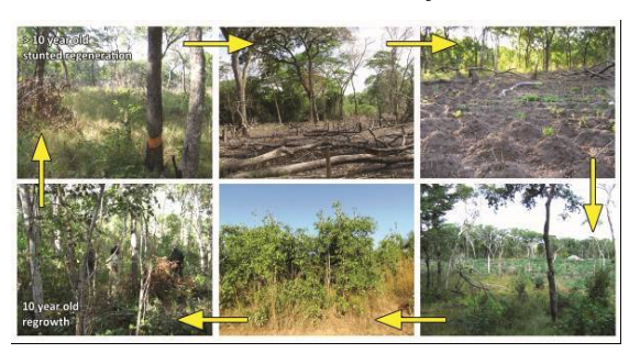
Figure 2. Cyclic clearing-cropping-fallowregrowth maintains diversity & productivity of Miombo (Source: Geldenhuys, 2016).

decisions are being made without a proper appreciation of the contribution of Miombo woodlands to national treasury.